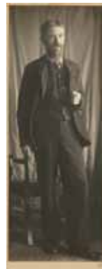
10. Frederick H. Evans British, 1853–1943 Portrait of George Bernard Shaw, 1902 Gelatin silver print Image: 23.7 x 8.9 cm (9 5/16 x 3 1/2 in.) The J. Paul Getty Museum, Los Angeles 84.XM.444.76