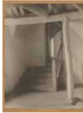
12. Frederick H. Evans British, 1853–1943 Kelmescott Manor: In the Attics (2), 1896 Platinum Image: 19.9 x 14.9 cm (7 7/8 x 5 7/8 in.) The J. Paul Getty Museum, Los Angeles 84.XM.444.1