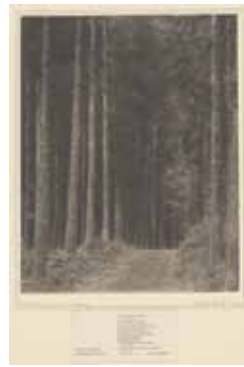
6. Frederick H. Evans British, 1853–1943 In Redlands Woods, Surrey, 1899–1904 Platinum print Image: 29.1 x 22.9 cm (11 7/16 x 9 in.) The J. Paul Getty Museum, Los Angeles 84.XM.444.34