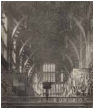
7. Frederick H. Evans British, 1853–1943 Chapel of Henry VII: Roof of Fan Tracery Vaulting, 1911 Platinum print Image: 21.7 x 18.7 cm (8 9/16 x 7 3/8 in.) The J. Paul Getty Museum, Los Angeles 84.XM.444.36