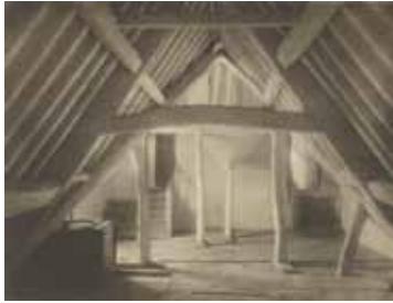
5. Frederick H. Evans British, 1853–1943 Kelmscott Manor: In the Attics (No. 1). 1896 Platinum print Image: 15.6 x 20.2 cm (6 1/8 x 7 15/16 in.) The J. Paul Getty Museum, Los Angeles 84.XM.444.89